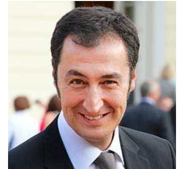
Cem Özdemir. Leader of the Green Party 2008-. first MP of Turkish parentage 1994