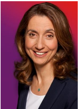
Aydan Özoğuz. one of six Deputy Leaders of the SPD and Minister of State in the Fed. Chancellor's Office for Migration, Refugees and Integration 2013-