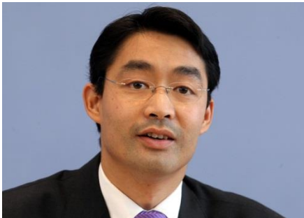
Philip Rösler. Federal Minister for Health 2009-2011. Deputy Federal Chancellor. Federal Minister of Economic Affairs. Leader of the FDP 2011-2013