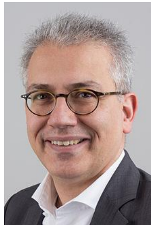
Tarek Al-Wazir. Minister of Economic Affairs, Energy and Transport and Deputy Minister President of Hesse 2014-