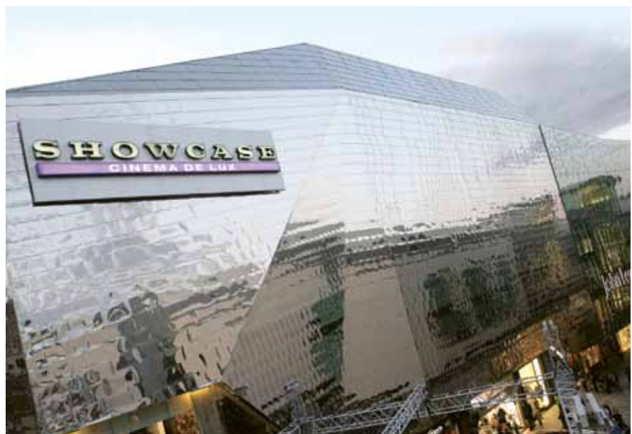
The Showcase Cinema at the Highcross Leicester.