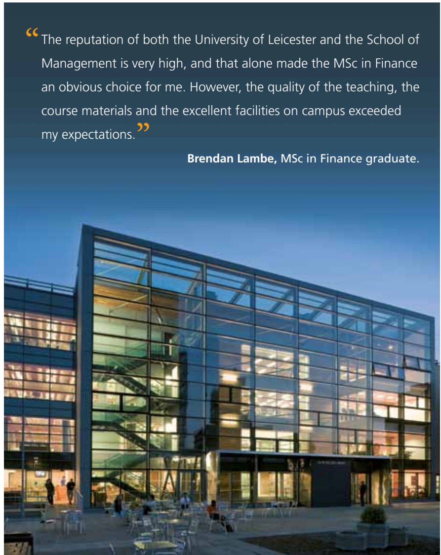
The University's David Wilson Library.